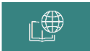
Approved Educator Preparation Programs Searchable Database