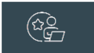
Professional Practices and Criminal Convictions