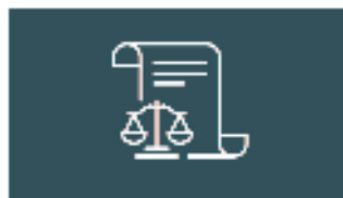
Law, Rule, Policy