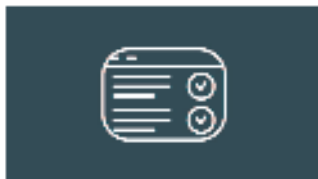
Permits and Placement