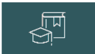
Educator Preparation Providers