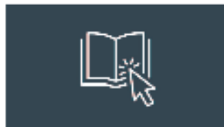
SCECH and DPPD